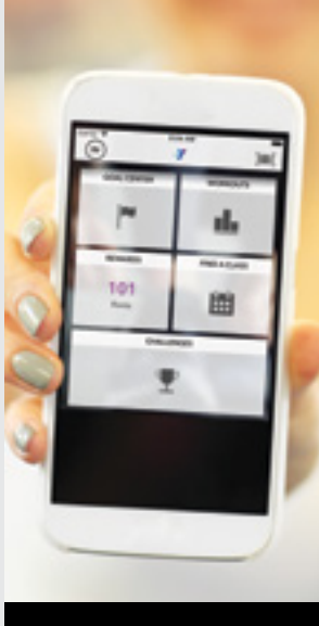
Available on the App Store